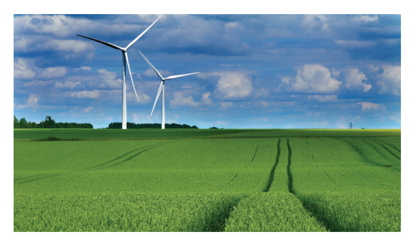
Figure 1.6 Our century is seeing an accelerating shift from using the fuels buried deep within Earth's interior to producing energy from sources that replenish themselves day after day - such as wind, solar, and biomass.

natural gas as the main fuel for electricity generation in the United States. Renewable energy sources (Figure 1.6) are coming down in price and increasing in their market share. And many of these changes are driven by the fear of accelerating climate change, caused by the unrestrained emissions of carbon dioxide into the atmosphere by fossil fuel combustion.