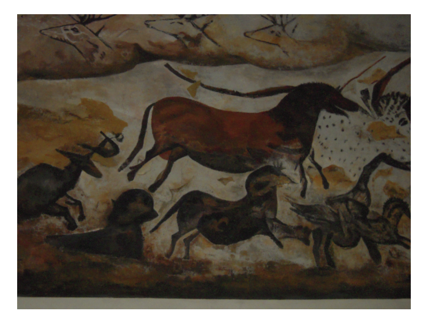
Figure 1.1 Early prehistoric depictions of ancestors of domesticated horses, found in a cave near Lascaux, France. Domestication of horses and other farm animals helped our ancestors cultivate fields and transport goods.

The next significant benchmark was the use of wind energy to power transportation, in the form of sailing ships. First sailing ships have been documented in Egypt and Phoenicia (present-day coastal Lebanon) around 4000 BCE. These were also the vessels