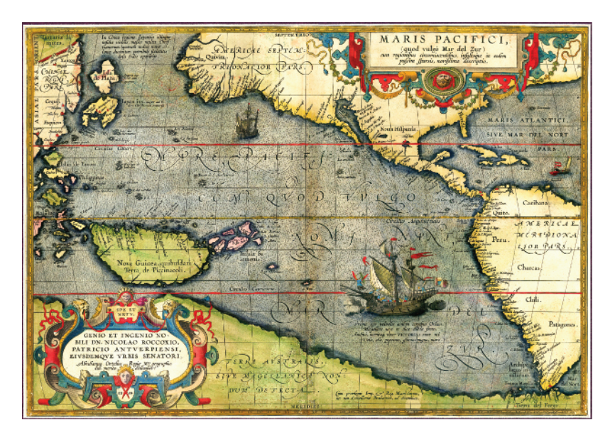
Figure 1.2 Portuguese explorer Ferdinand Magellan (c. 1480–1521) was the first to circumnavigate the globe in the years before his death. Wind-powered Victoria, featuring prominently in this map of the world, was the sole ship of his expedition to complete the journey, opening a new era of colonial expansion of Portugal and other western European powers. Source: Ortelius's map (1590), in public domain because of its age.

Pause here for a minute and reflect on the fact that the vast Roman, Mongol, and Spanish empires were built on just three sources of energy: wood, domesticated animals, and wind! All three of them were what we today call renewable sources of energy, even though most of the forests cut down in those days were not actively replenished. It was another empire – the British empire – that required a new source of energy. As population growth, industrialization, and maritime trade started significantly depleting British forests, coal became a useful and apparently inexhaustible alternative to wood. The steam engine, made practical in the 1770s by James Watt, accelerated the ascension of coal, a fossil fuel, into Britain's most significant energy source. Combustion of coal in the steam engine produced pressurized steam, which could be used to mechanically move pistons of