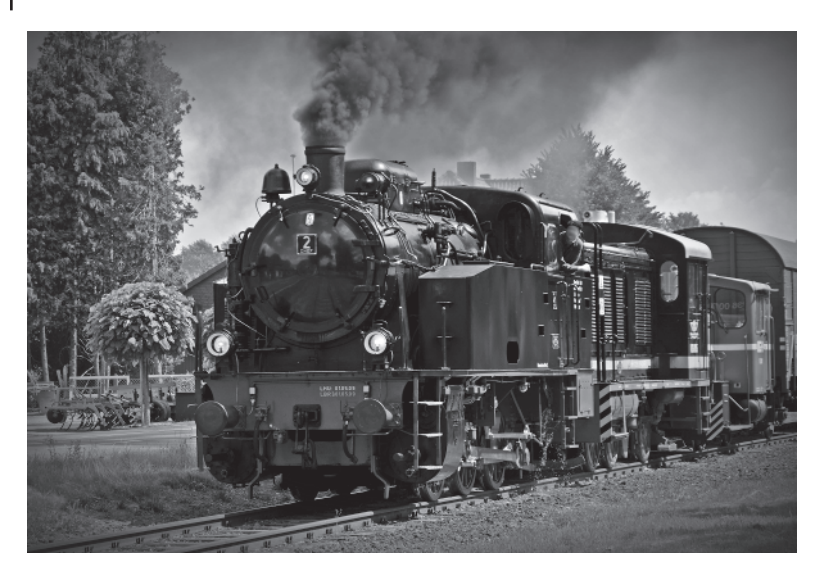
Figure 1.3 Coal-powered trains are one of the enduring images of industrialization. Today, however, they are increasingly a tourist attraction: even trains transporting coal to power plants run on – diesel.

an engine. The development of railways followed shortly (Figure 1.3), leading to the creation of an internal transportation infrastructure that could move people and cargo on land. The abundance of coal in Britain allowed the country to become the first true industrial power in the world, spreading its economic and military influence across the globe. However, the mining, transportation, and combustion of coal brought with it the pollution, which was significantly worse than that coming from wood. The beginnings of the Industrial Revolution in Britain were associated with the first concerns about the environmental effects of high energy use.